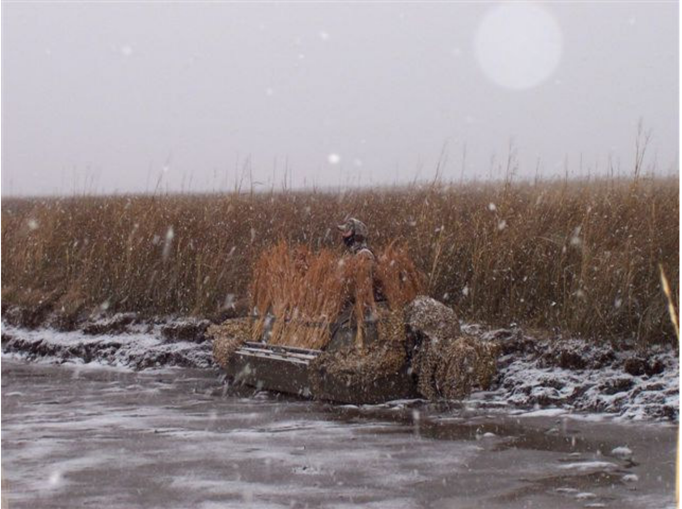
Hunting out of the prototype on a cold, snowy day in Maryland.